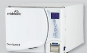
DentiSure B18 and B23